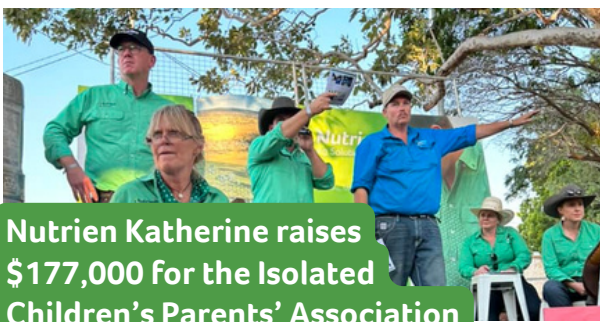
Nutrien Katherine raises $177,000 for the Isolated Children’s Parents’ Association

We empower our people to support local organisations who contribute to the strength and vibrancy of their local communities.