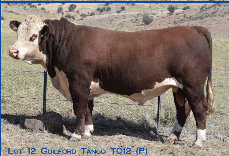
LOT 12 GUILFORD TANGO T012 (P)