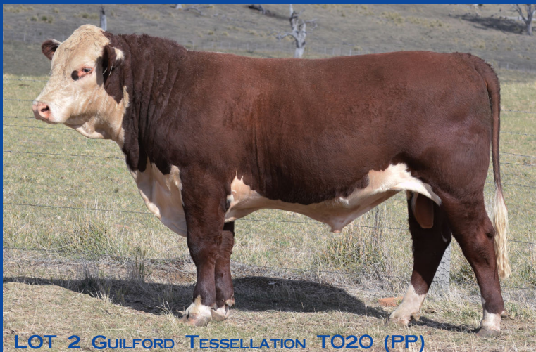
LOT 2 GUILFORD TESSELLATION T020 (PP)