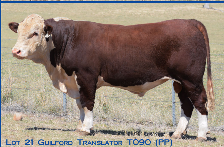
LOT 21 GUILFORD TRANSLATOR T090 (PP)