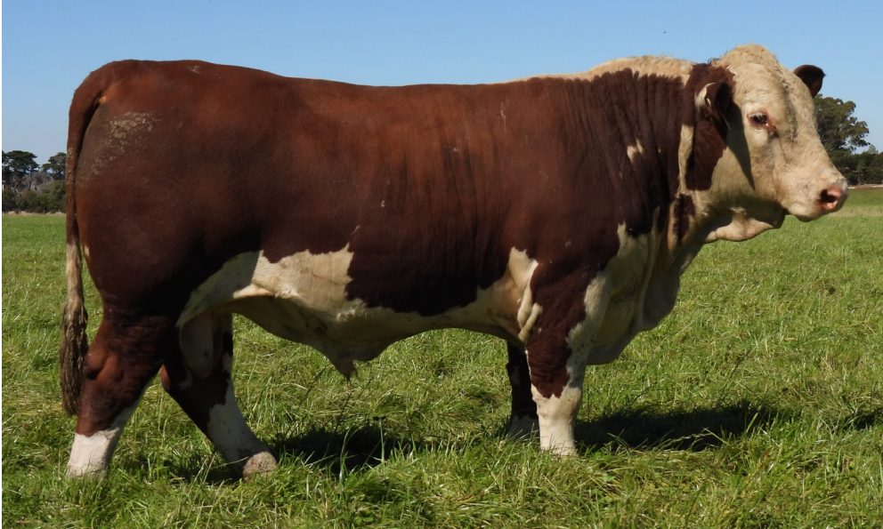
LOT 12 - OPCT371