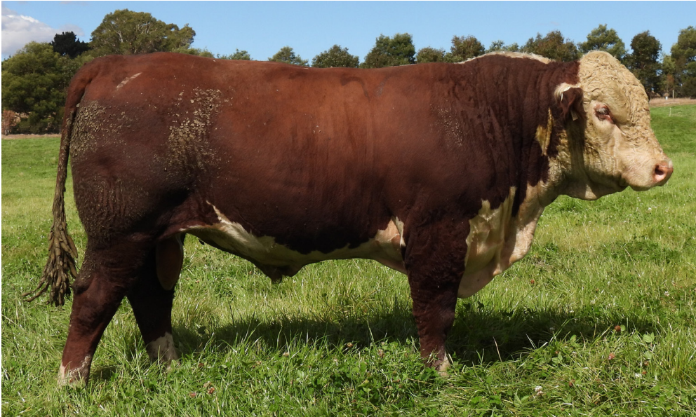
LOT 13 - OPCT414