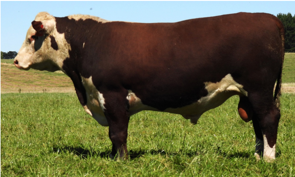
LOT 14 - OPCT459