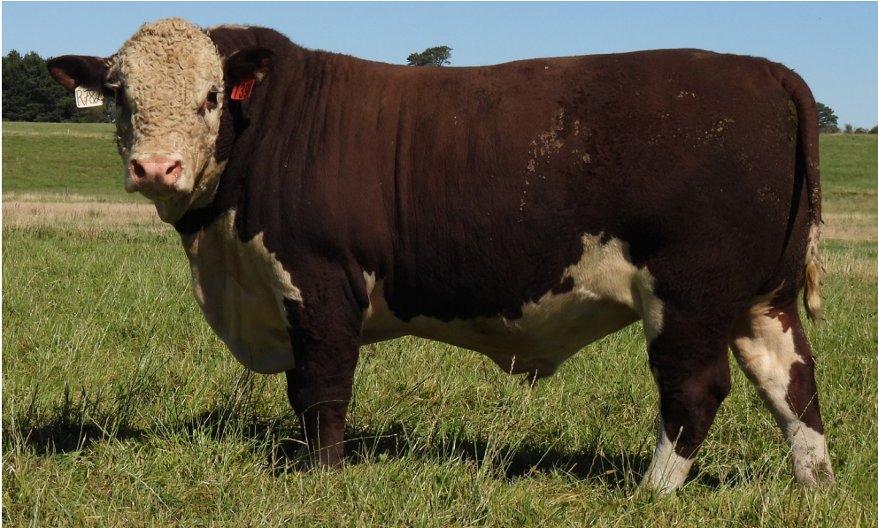
LOT 7 - OPCT399