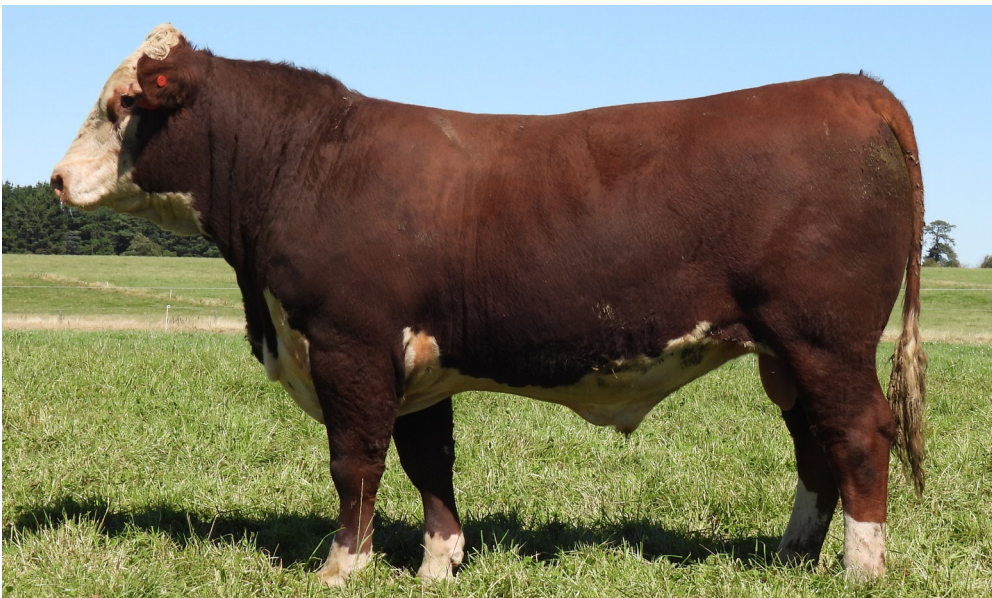
LOT 11 - OPCT345