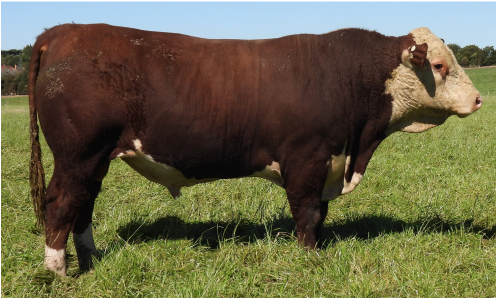
LOT 10 - OPCT329