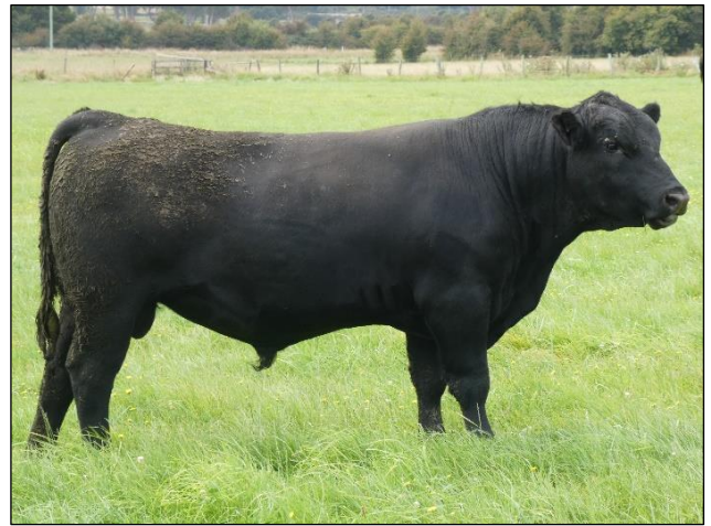
LOT 21 LONDAVRA REAR VIEW R80