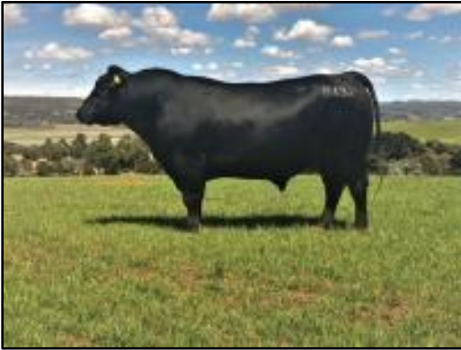
LANDFALL KEYSTONE K132