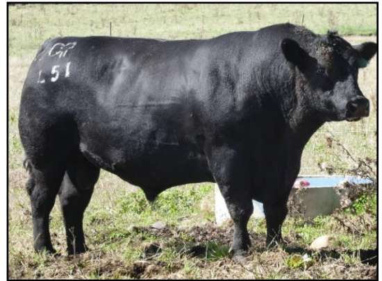
RAFF STEWIE L51 QRF L51