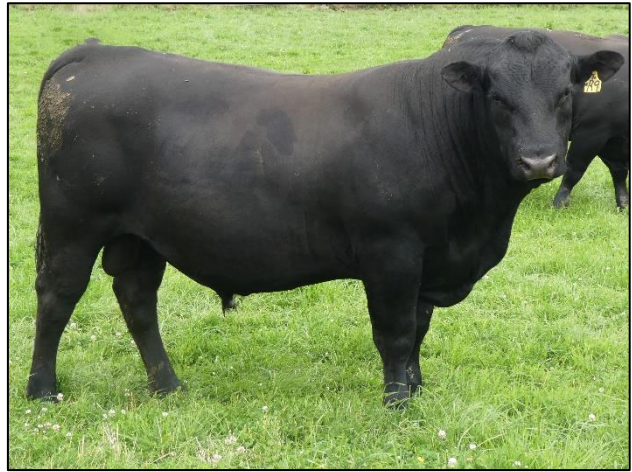
LOT 8 LONDAVRA MARLON BRANDO R9