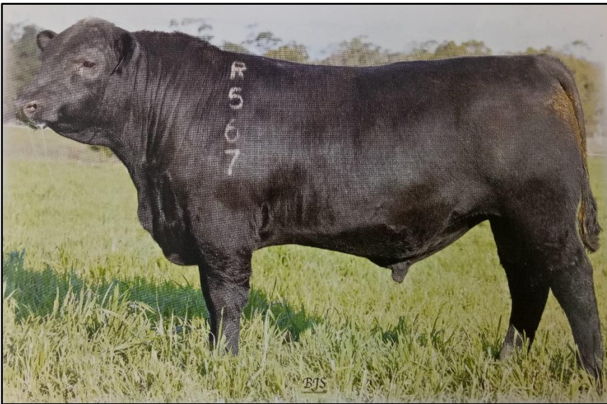
CIRCLE 8 R567 SON OF MILLAH MULLAH PARATROOPER P15 Purchased at the 2021 Circle 8 Sale for $44000