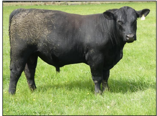
LOT 2 LONDAVRA EDMUND R23