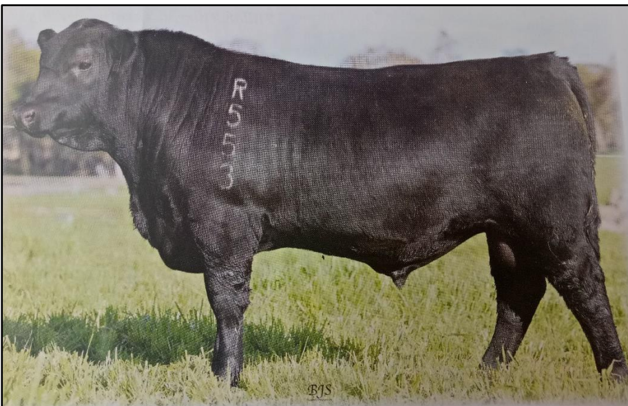
CIRCLE 8 R553 SON OF MILLAH MURRAH PARATROOPER P15 Purchased at the 2021 Circle 8 Sale for $44000.