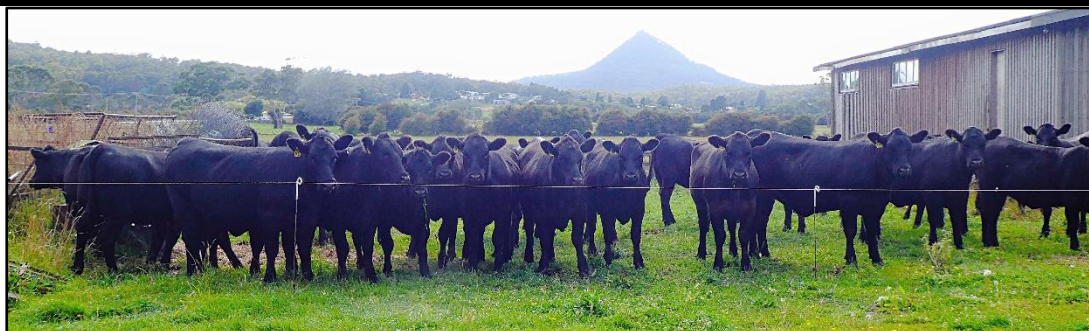
Londavra stud heifers – sisters to the sale bulls.