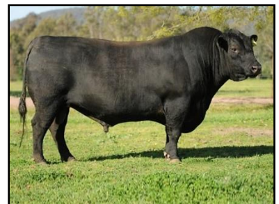
RENNYLEA EDMOND E11