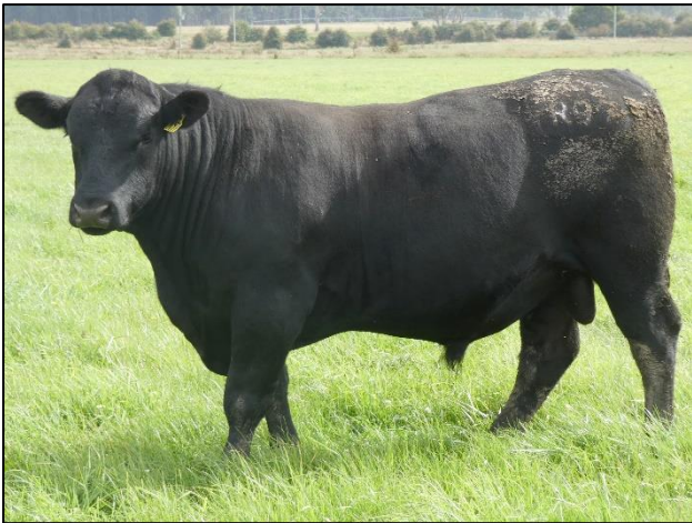
LOT 9 LONDAVRA DISTINCTION R97