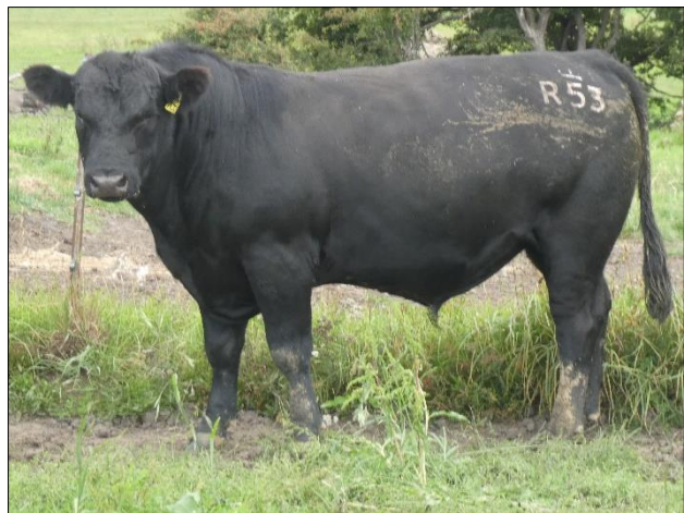
LOT 12 LONDAVRA STEWIE R53