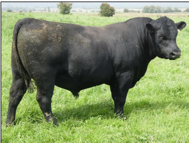
LOT 11 LONDAVRA REAR VIEW R62