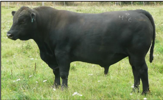
CLUDEN NEWRY SYDGEN H16