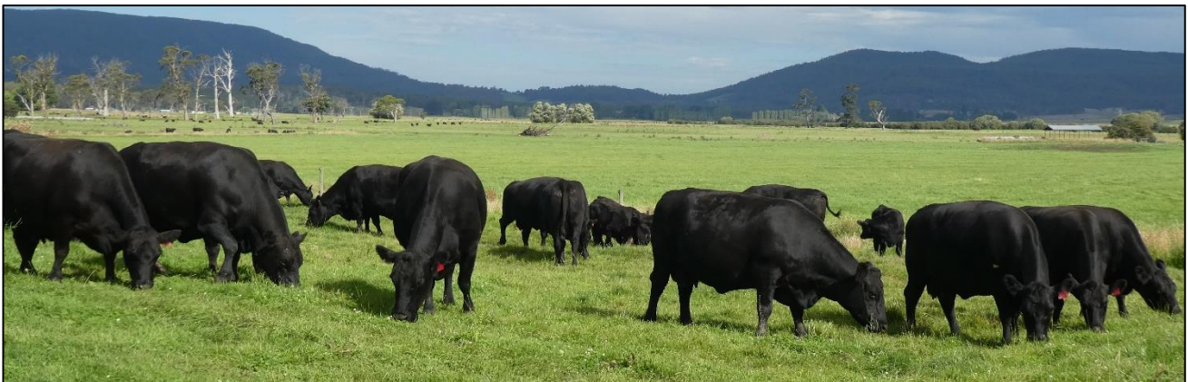
Londavra Commercial Cows

Front cover photo – Group of this year's sale bulls.