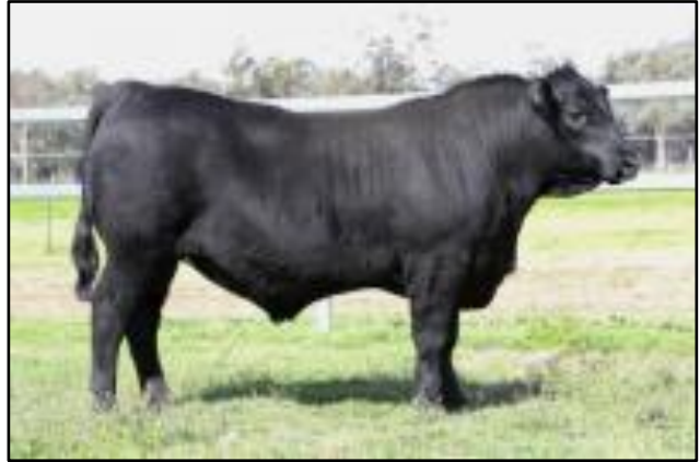
CLUNIE RANGE LEGEND L348