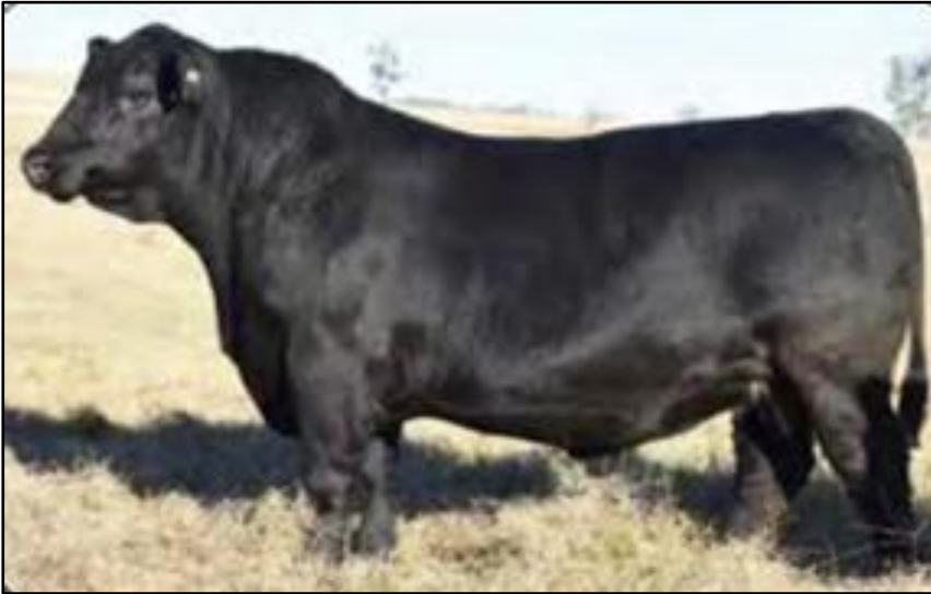
TEXAS BEAST MODE Q725 son of Baldrige Beast Mode B074 purchased at the 2021 Texas bull sale for $36000