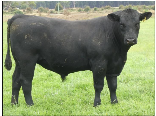
LOT 18 LONDAVRA LEGEND R29 (next page)