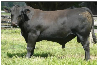
RAFF DISTINCTION L205