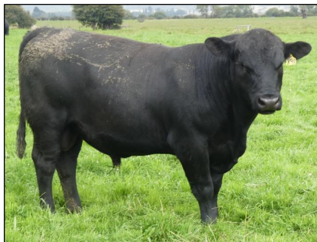
LOT 14 LONDAVRA SYDGEN R91