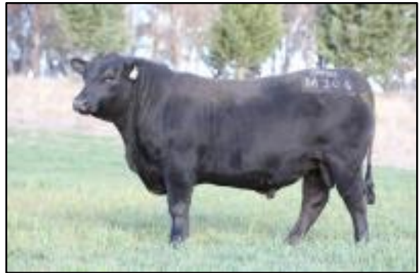
MILLAH MURRAH MARLON BRANDO M304