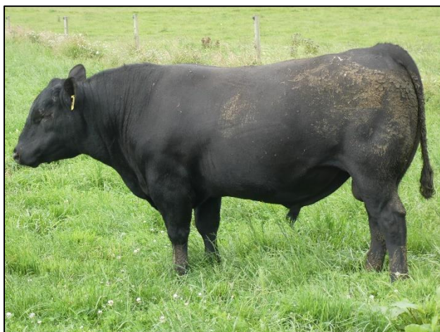
LOT 13 LONDAVRA KRAKATOA R10