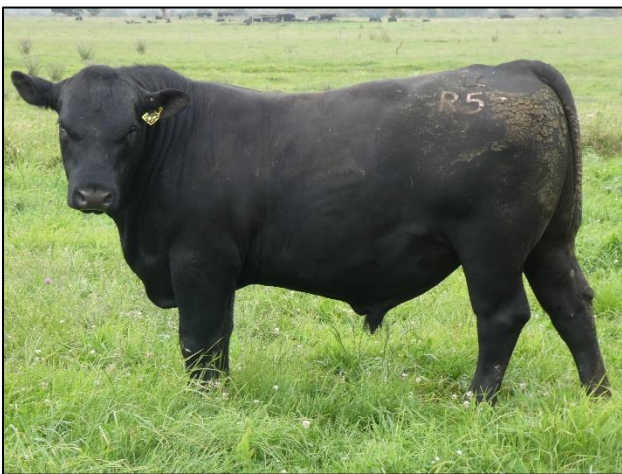
LOT 3 LONDAVRA REAR VIEW R55