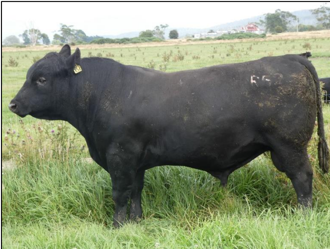
LOT 5 LONDAVRA REAR VIEW R52