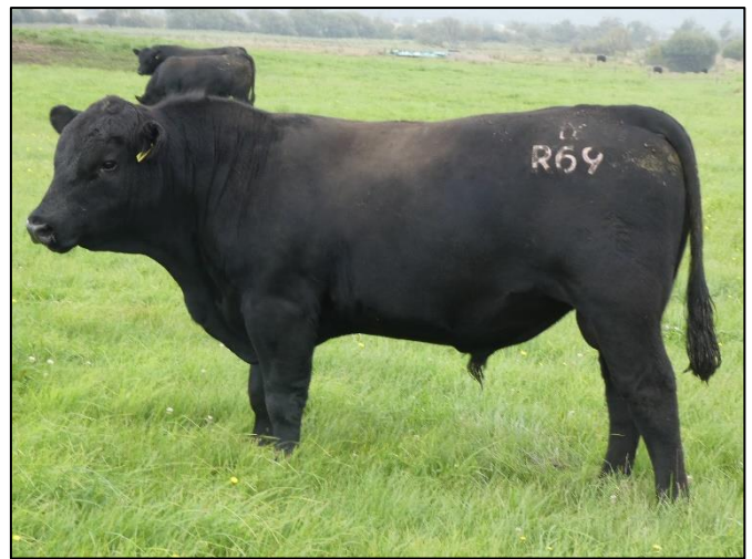
LOT 6 LONDAVRA SYDGEN R69