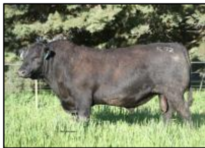
MILWALLAH KRAKATOA K92