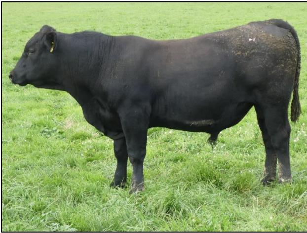
LOT 7 LONDAVRA SYDGEN R96