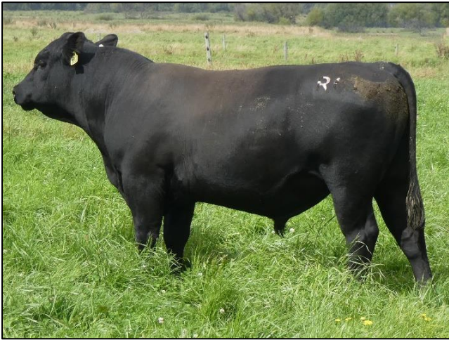
LOT 20 LONDAVRA SYDGEN R61