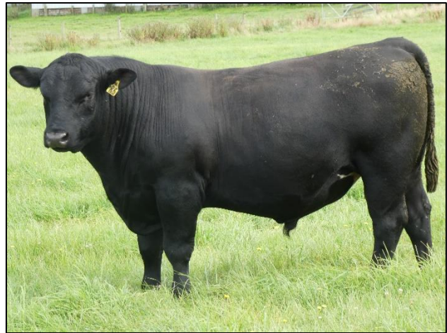
LOT 10 LONDAVRA EDMUND R5