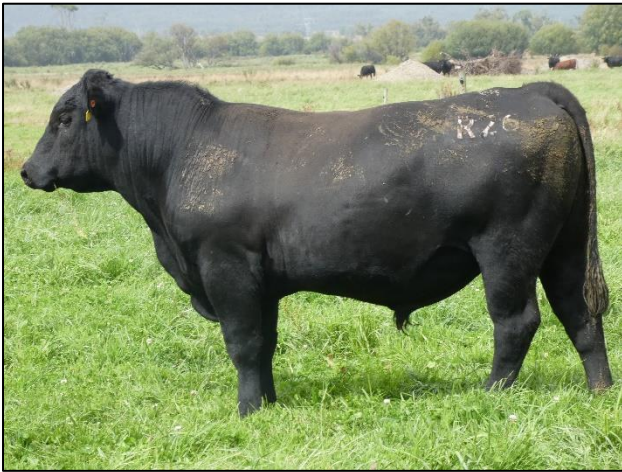
LOT 1 LONDAVRA KEYSTONE R26