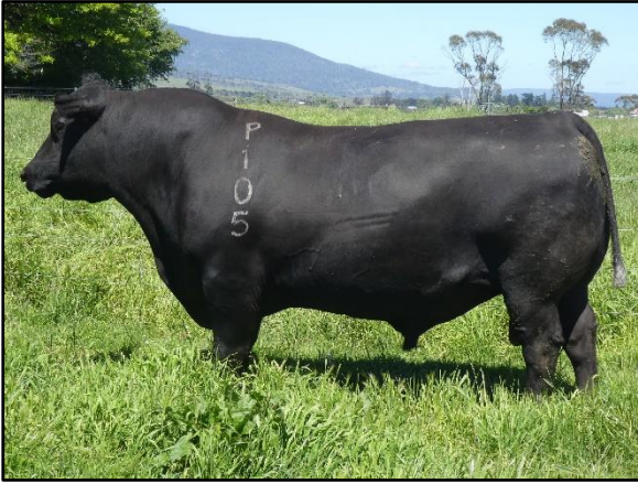
CIRCLE 8 REAR VIEW MIRROR P105