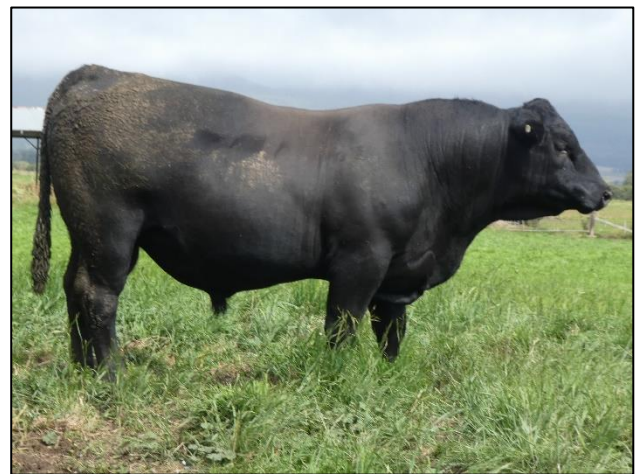
LOT 4 LONDAVRA DISTINCTION R88