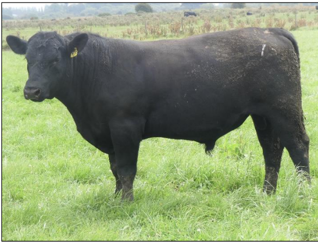
LOT 15 LONDAVRA STEWIE R75