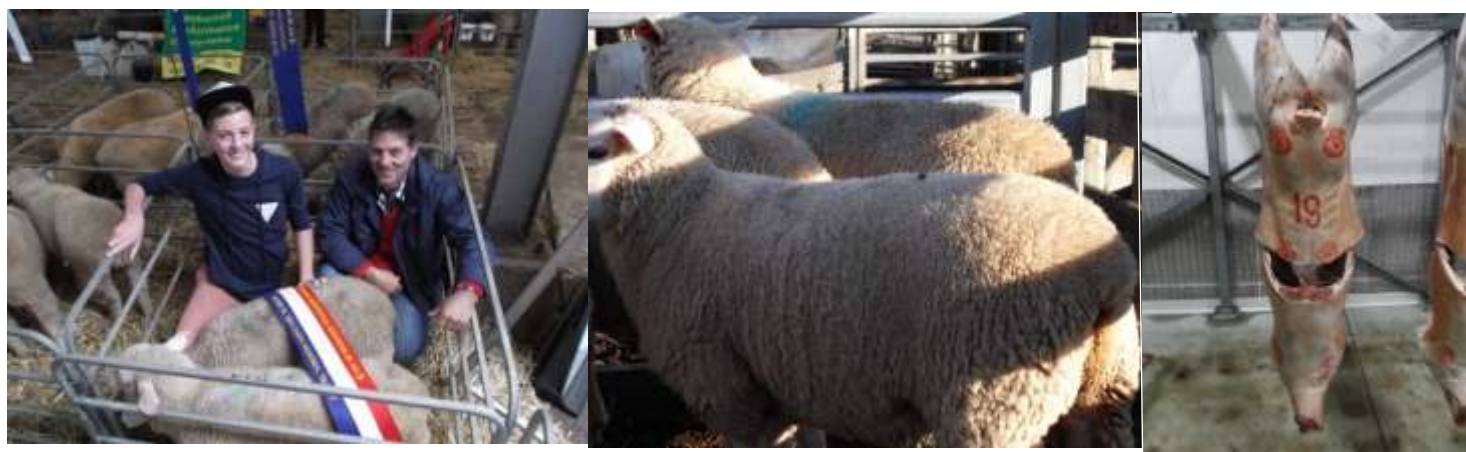
2015 Peter Williams Memorial Trophy winning lambs in the Campbell Town Show's "Paddock to Plate" competition.

Leith lambs have previously won the trade class in 2011, 2013 & 2014 & the export section & Peter Williams Trophy in 2014