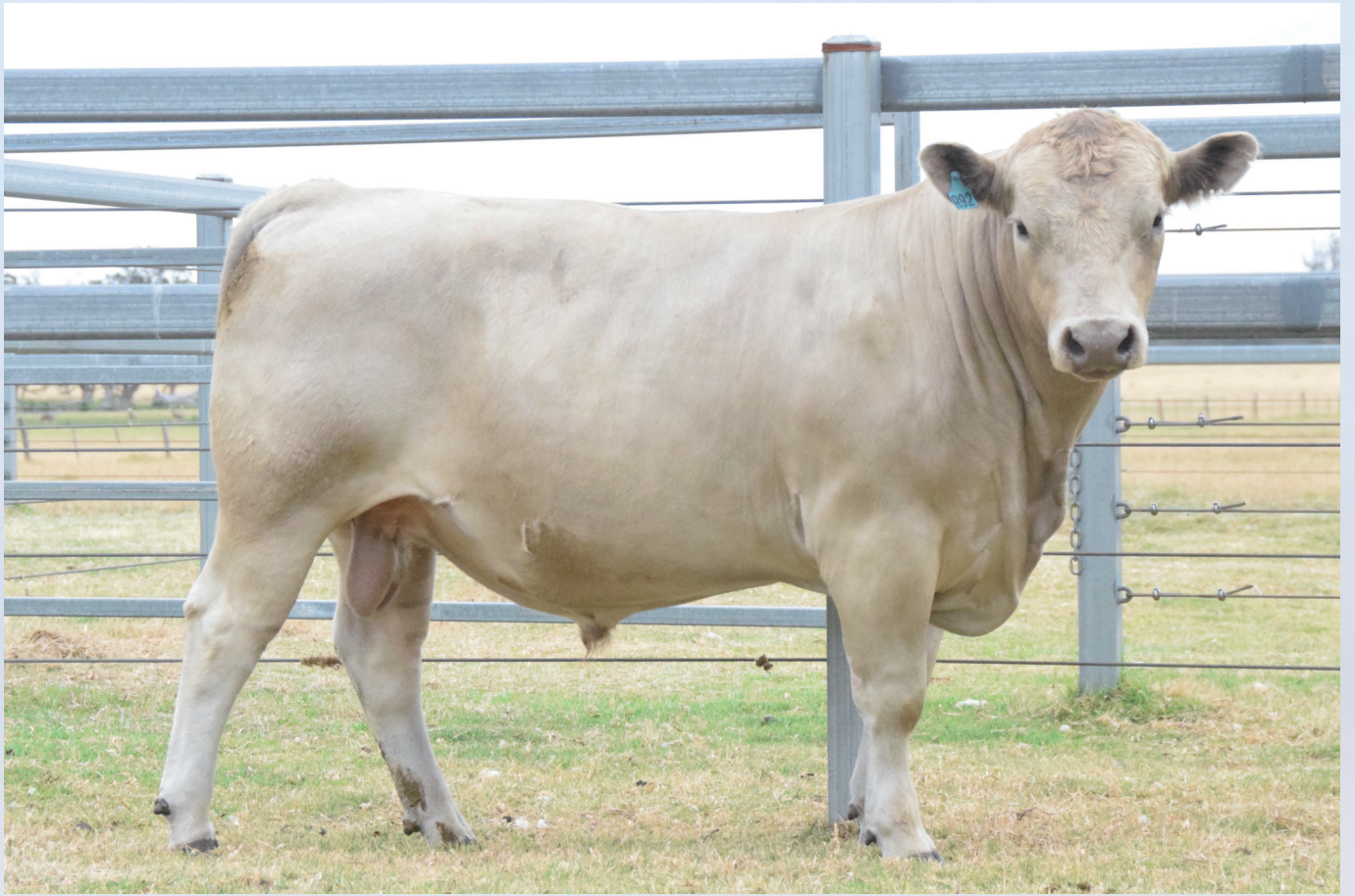
Lot 100 - Melaleuca Rambo R92