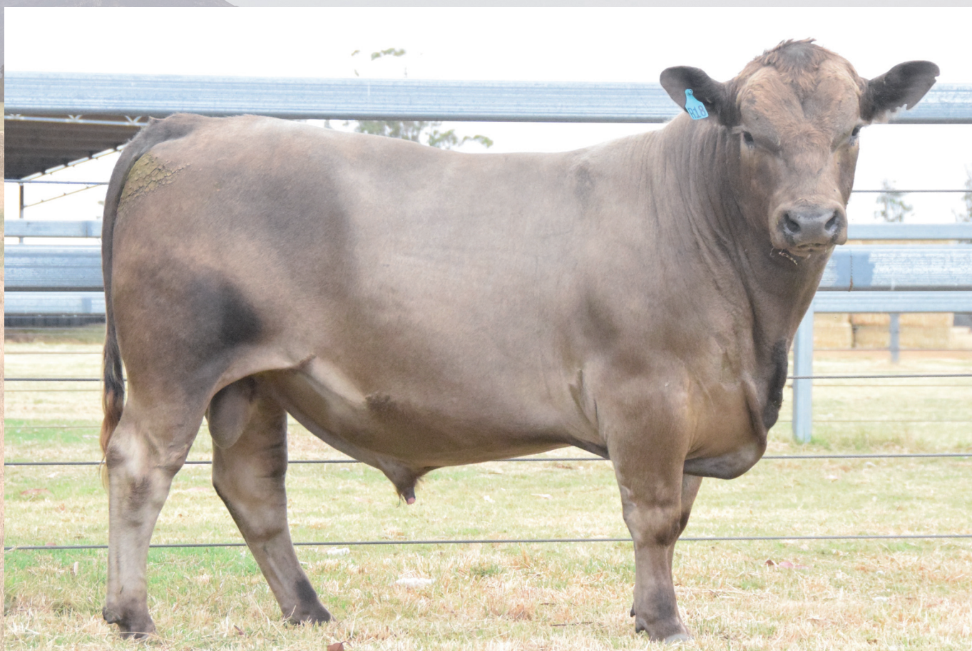
Lot 113 - Melaleuca Roman R18