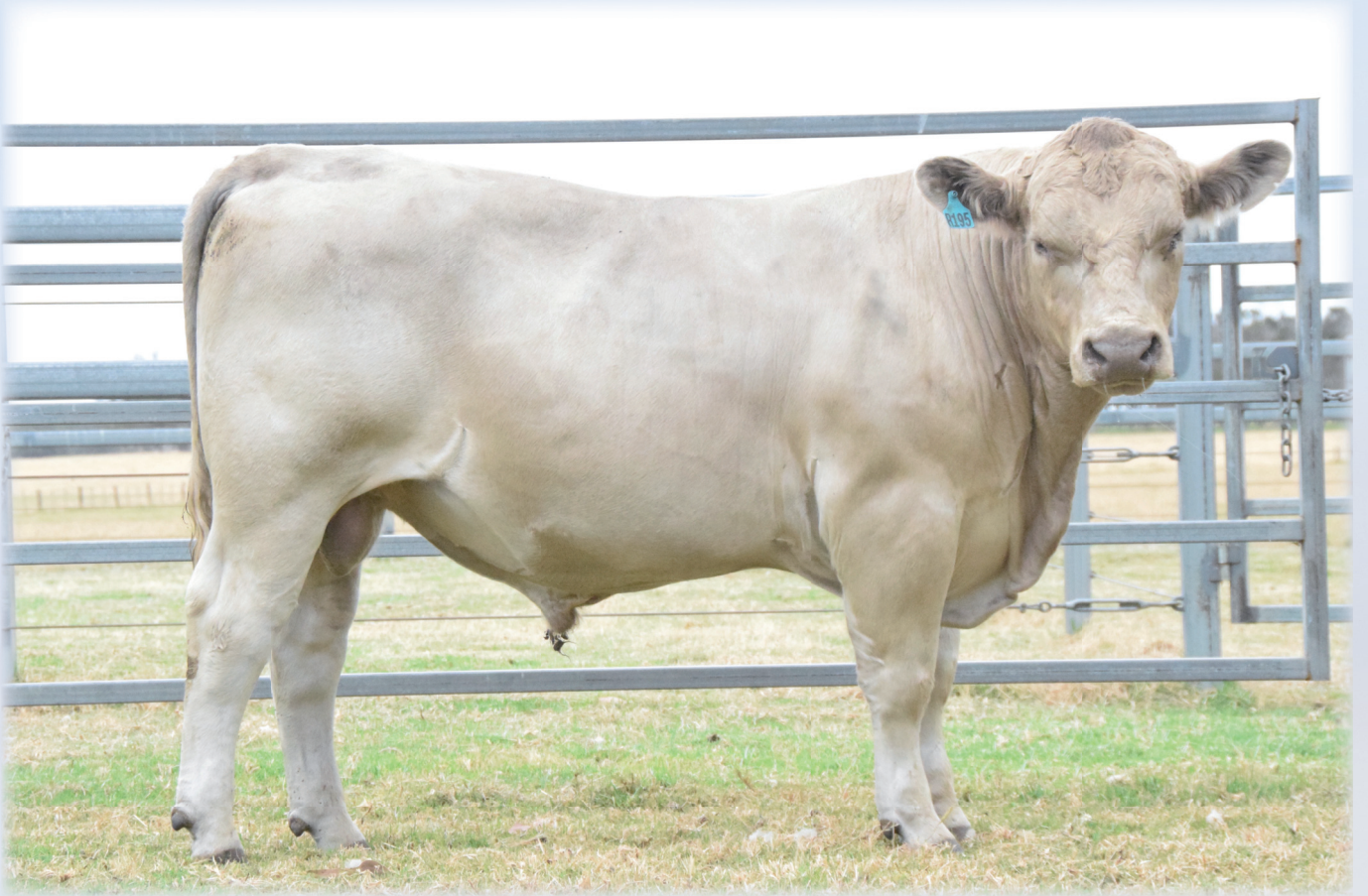
Lot 105 - Melaleuca Roman R195