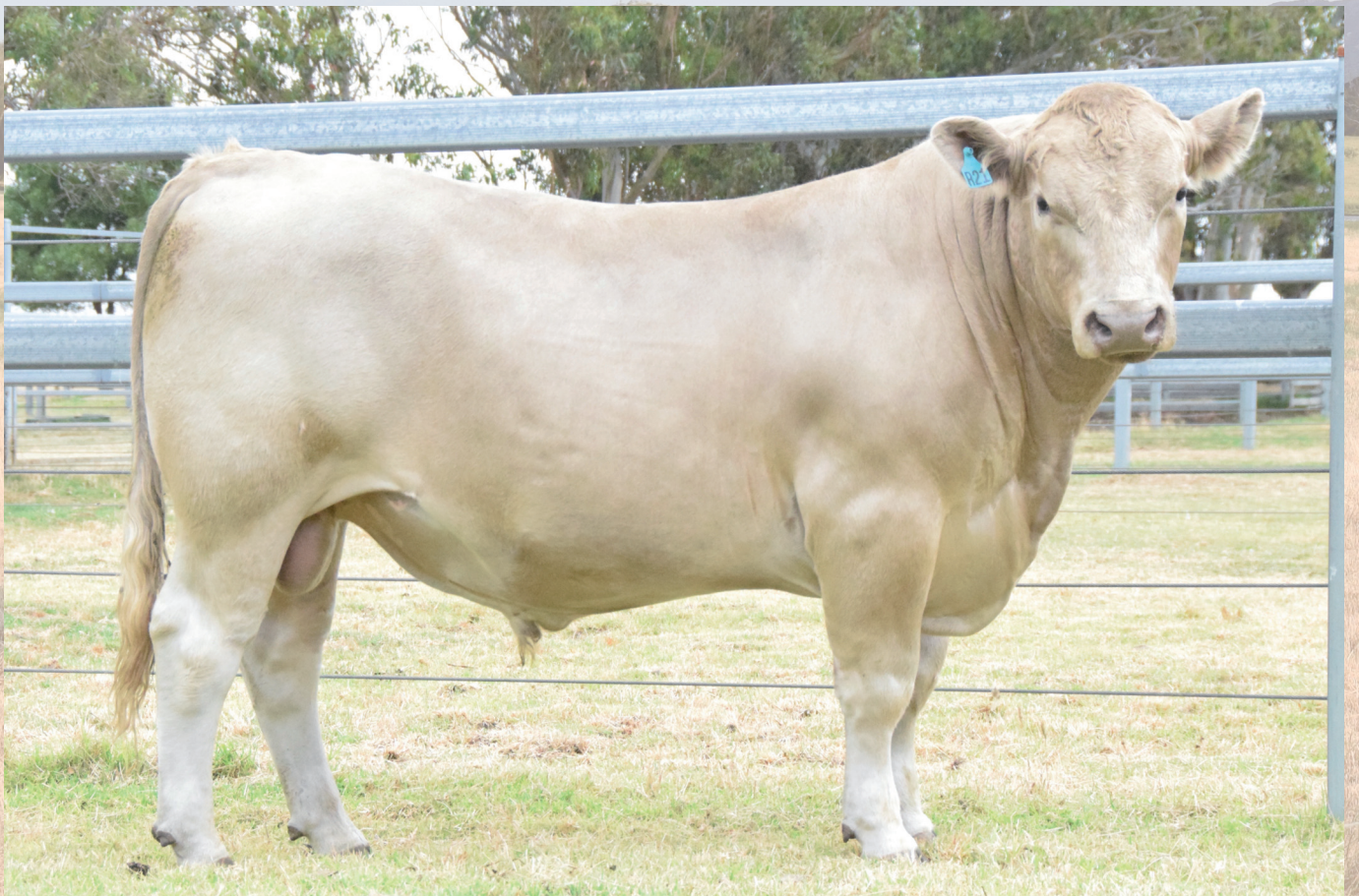
Lot 101 - Melaleuca Rancher R21