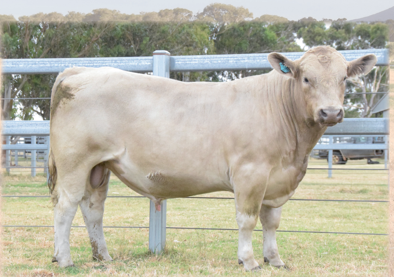
Lot 108 - Melaleuca Roman R118