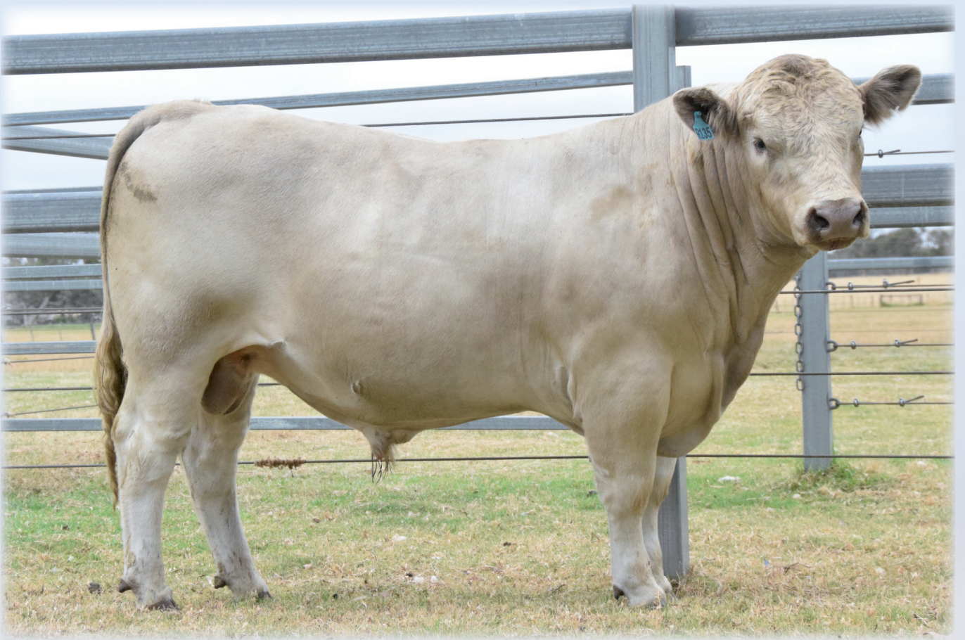
Lot 102 - Melaleuca Rancher R135