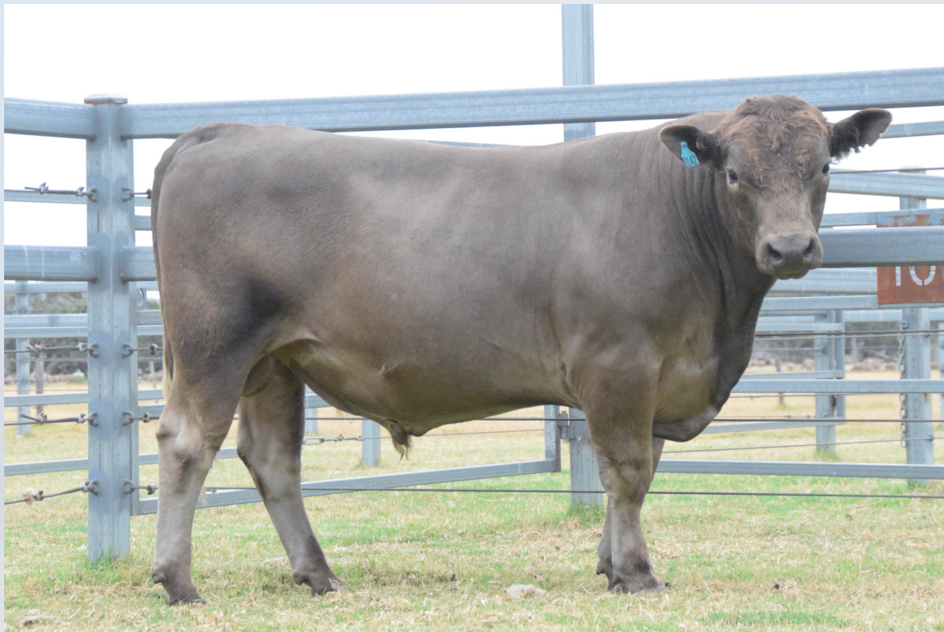
Lot 111 - Melaleuca Rancher R142