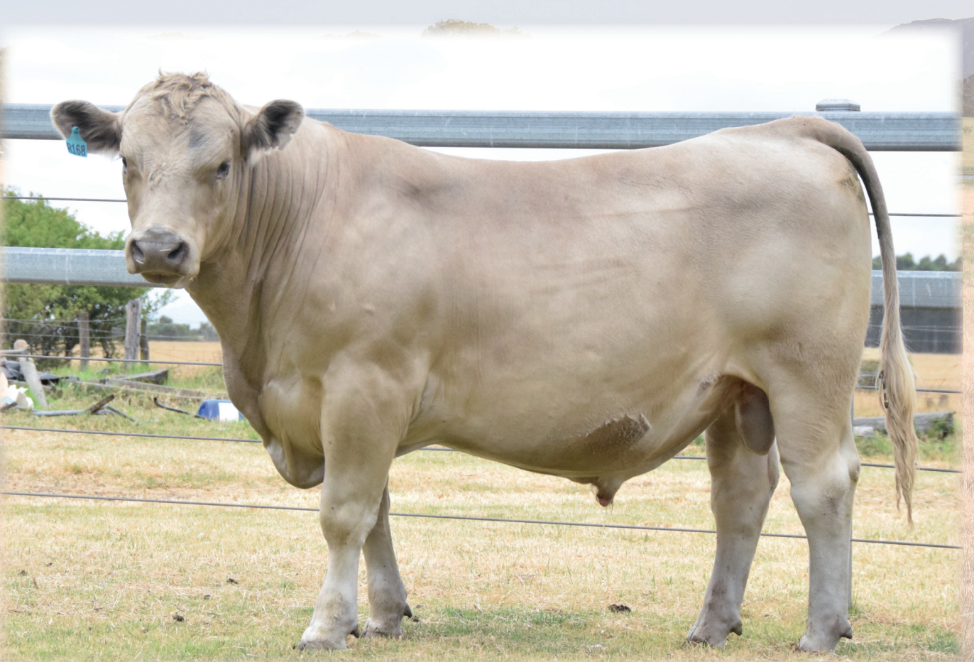
Lot 104 - Melaleuca Republican R168