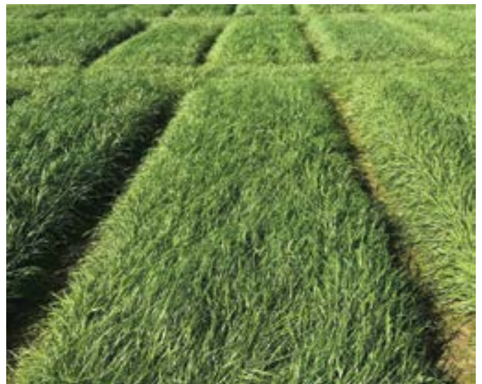
Dyna-Dux sown 14th April 2020, photo taken 2nd June 2020. Ellinbank, VIC

Note: pasture productivity is directly related to successful plant establishment.