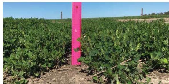
Dormancy 3 variety

10 weeks growth from 24/5/2018 – 16/8/2018 – Keith. SA