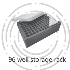
96 well storage rack