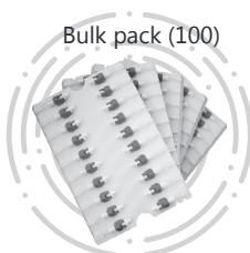
Bulk pack (100)

Questions? 1300 138 247 or contact@allflex.com.au