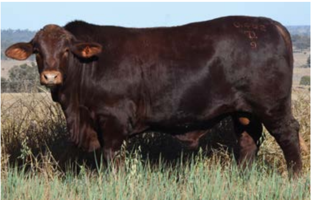
Second Top priced bull Dunlop Ultimate Q482 (PP) purchased by Sutton Beef, Glenmorgan for $33,000