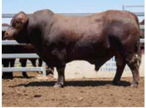
Dunlop Snapdragon N82 (P)