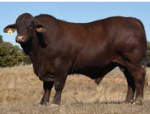
Diamond H Vegemite (P)