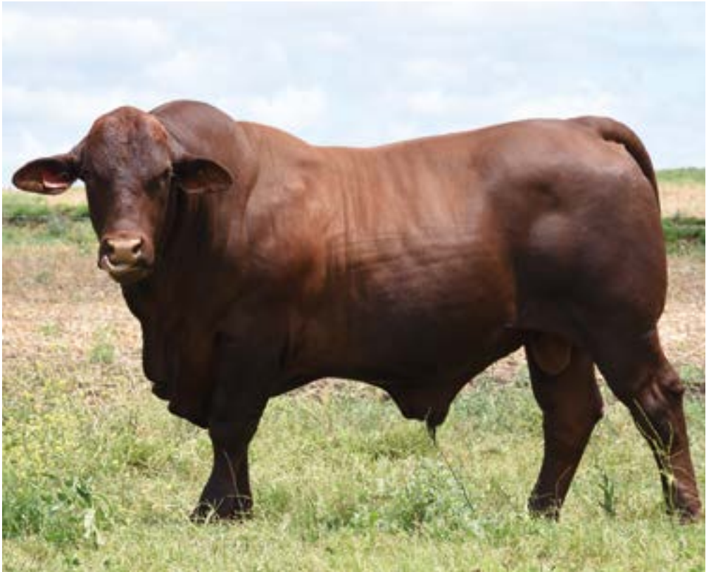
YULGILBAR KINGSVILLE K118 (P)