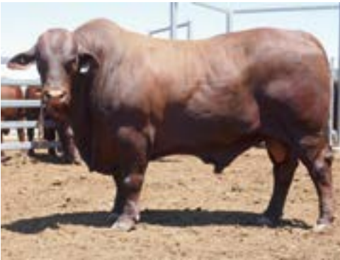
Dunlop Swagger N584 (P)