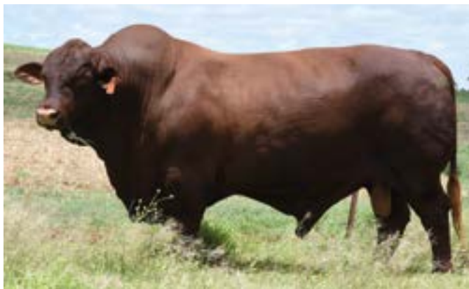
Wave Hill G16