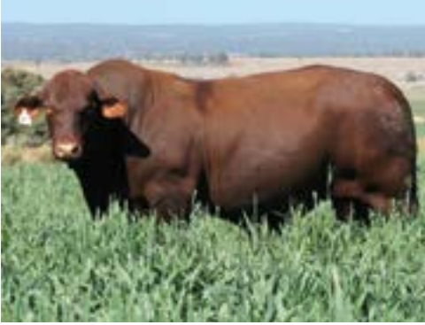
Greenup Patriarch P78 (PP)