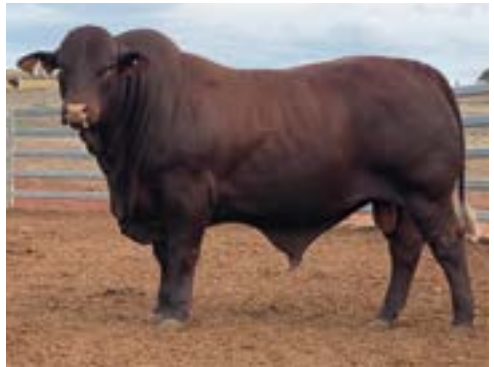
Dunlop Ulbert Q244 (PP)