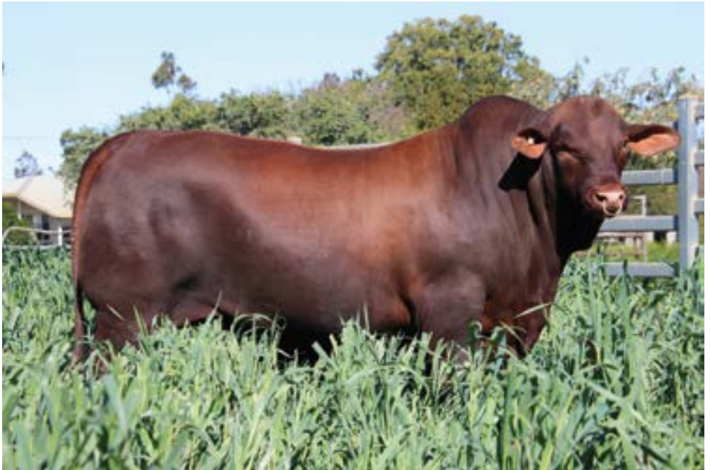
FUTURE SIRE – Dunlop Victory R250 (P)