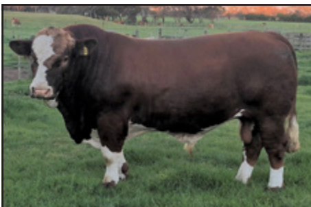
BRENAIR PARK NOBLE