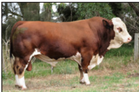
BRENAIR PARK METUNG