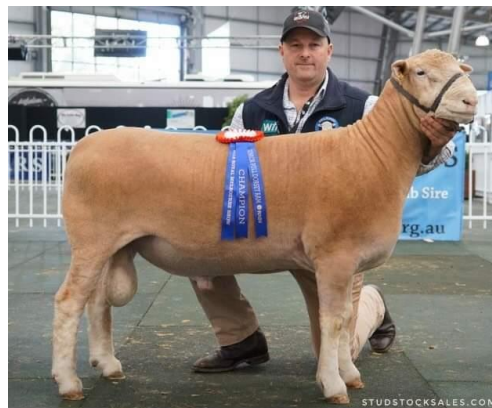
Melbourne Champion Ram 2018