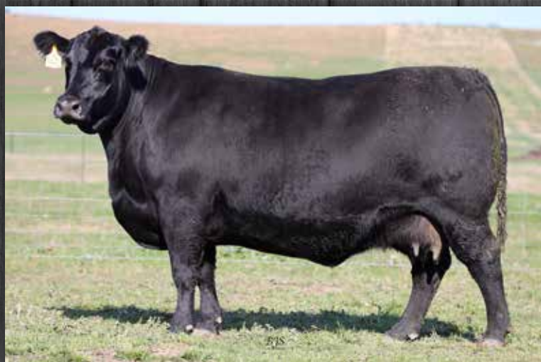
Lot 76 ASHM22