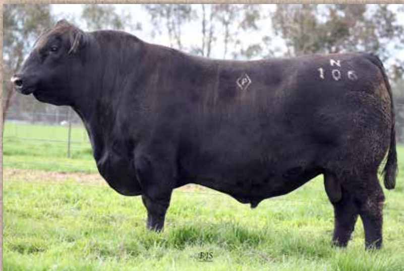
ASHN106 Premier Broken Bow N106 Joining Sire