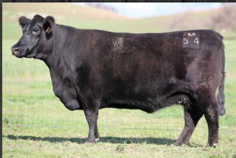
Lot 77 ASHM54