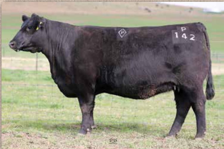
Lot 36 ASHP142 J28 daughter