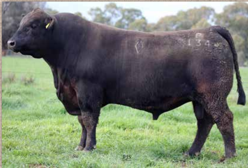
ASHP134 Premier Guardian P134 Joining Sire