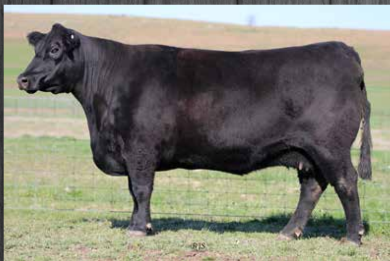
Lot 7 ASHK42