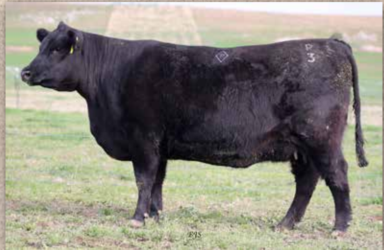
Lot 23 ASHP3 D901 daughter