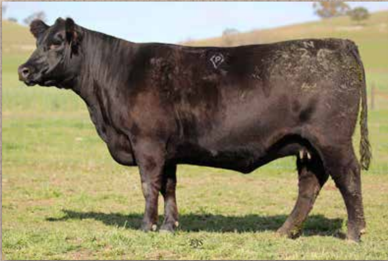
Lot 30 ASHN24 B207 daughter