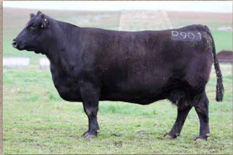
Lot 15 CCVD901