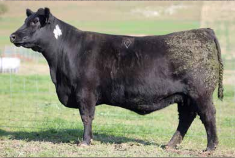
Lot 37 ASHP109 B207 granddaughter