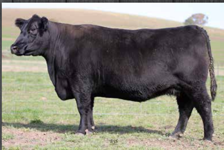
Lot 14 ASHJ15