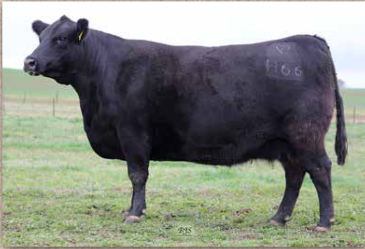
Lot 4 ASHH66 D901 daughter