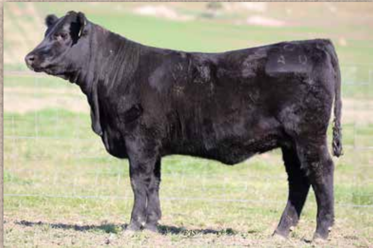
Lot 160 ASHQ40 B207 granddaughter