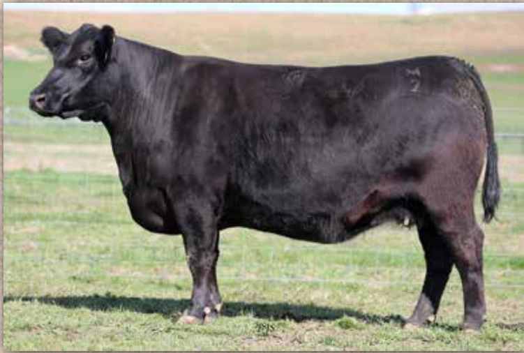
Lot 75 ASHM2 H66 daughter