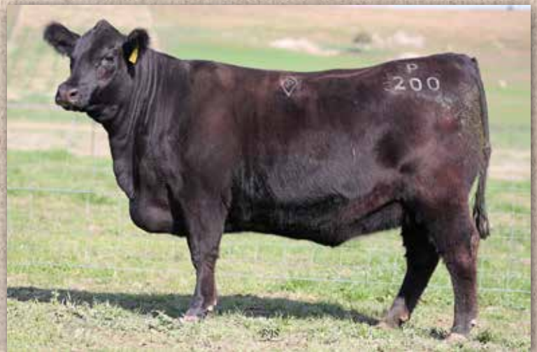
Lot 40 ASHP200 G13 granddaughter