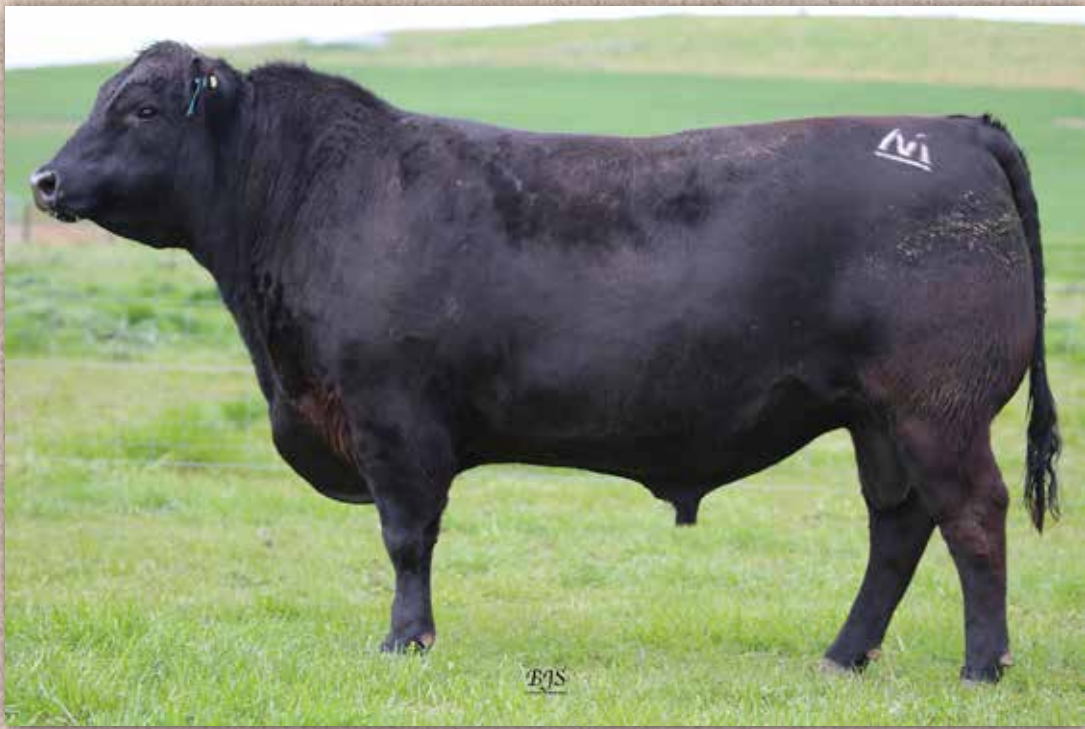
Lot 206 NJWN498 Milwillah Napa N498