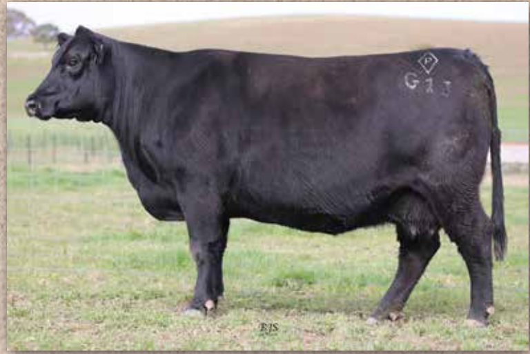
Lot 3 ASHG13 Y301 daughter