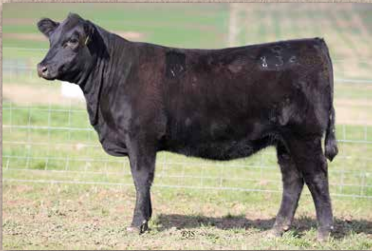
Lot 155 ASHQ134 K62 daughter