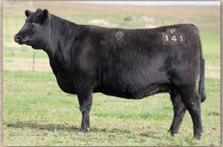
Lot 24 ASHP141 G13 daughter