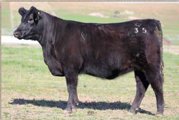
Lot 159 ASHQ35 H66 granddaughter