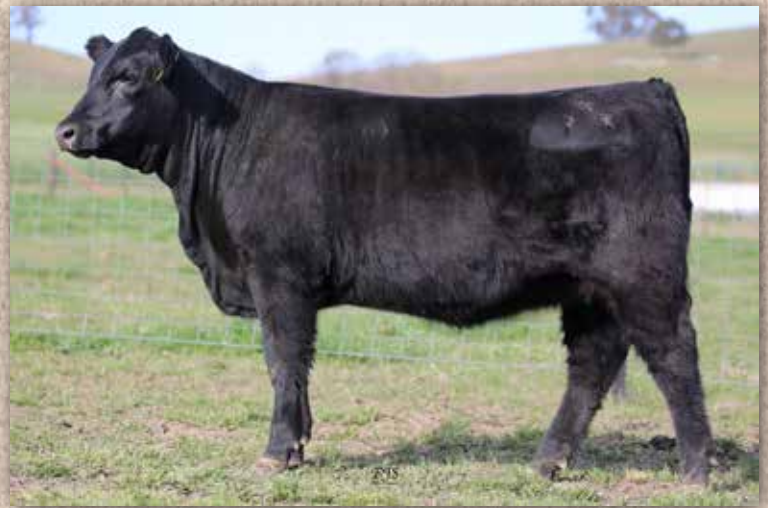
Lot 158 ASHQ73 J74 daughter