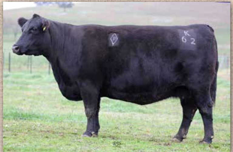
Lot 9 ASHK62 Y301 daughter