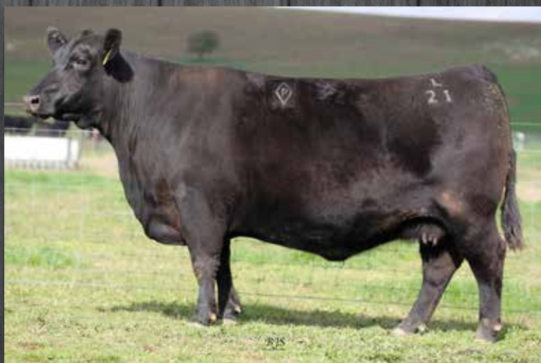
Lot 98 ASHL21