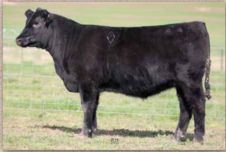
Lot 161 ASHQ44 N55 daughter