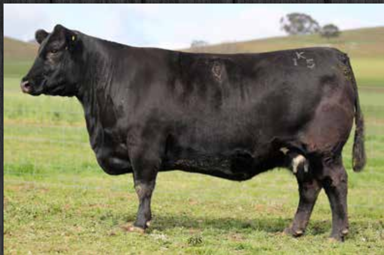
Lot 2 ASHK15