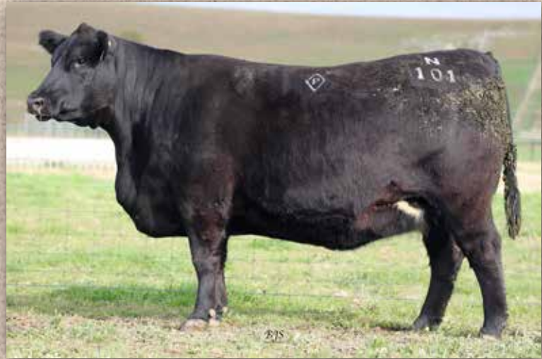
Lot 19 ASHN101 D901 granddaughter