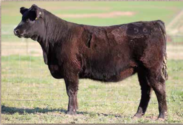
Lot 156 ASHQ56 M2 daughter